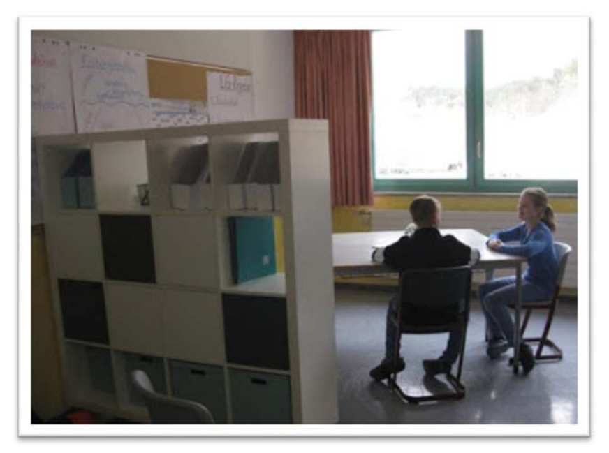
Mediators at work

To enable students to resolve conflicts themselves, without the intervention of teachers, we established a mediator system. Interested students from grade 7 and older get trained in conflict management. They have their own room, where during the breaks they help other pupils to end fighting and come to a solution that helps both rivals.