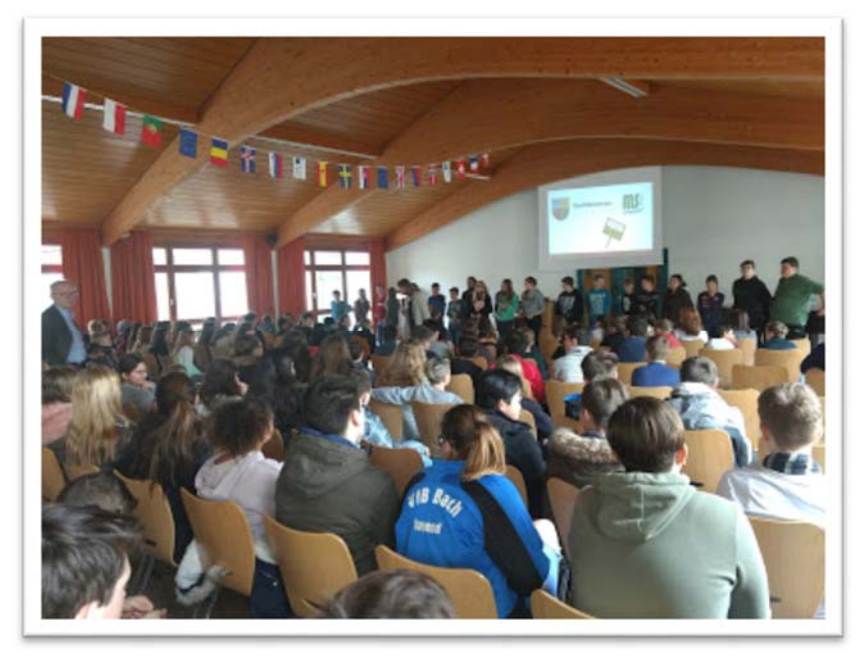
Presentation of the new mediators

The mediators are well accepted by their schoolmates and already helped to end lots of conflicts before they resulted in actual bullying.